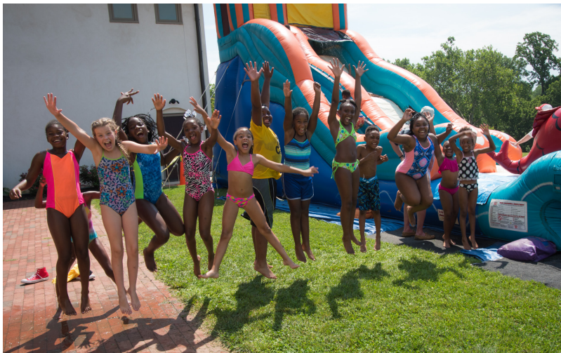
Cool, wet, and light as air—a happy moment at Camp Get-Along in July!