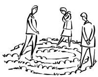
Moonlight Labyrinth Walk

Come join us to explore the contemplative power of the labyrinth under autumn's full harvest moon from 7 to 8.30 on Wednesday evening, September 6 . The labyrinth offers a deep sense of possibility; its ancient form guides us into our inner wisdom. This meditative walking path invites the healing, integration and peace that we crave in our modern world, and all are welcome to attend.